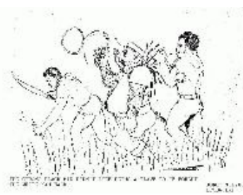
Click for full size picture. (12K)